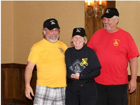
2 nd Place Loser in 36 hr Rally

Long distance rallies are not your typical motorcycle rally. LD rallies are scavenger hunts! These scavenger hunts can range from 8 hours up to 11 days in length. They usually have a theme that may vary every year. The NIITWIt (Not in it to win it) Rally has unique concept in that you try to lose rather than win. Kind of a tongue in cheek concept that adds to the fun!