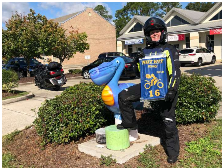
1 of 3 Pelicans in Slidell, LA

On the way to the anchor in Slidell, we collected several more bonuses including 3 pelican statues!