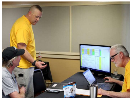
A friend getting scored

and verify all the bonuses that we have claimed over the past 36 hours. After doing this, we get in line for scoring. This process goes quickly since we email our pictures to Rally Headquarters as we take them during the rally. So, the scoring process is really just verification and agreement between us and the scorer. 40,000 points (for bagging the 4 state fleet) minus our other bonus deductions equated to 21,798 total points. Now to wait for the finisher's banquet to see how we compare to the rest of the field!