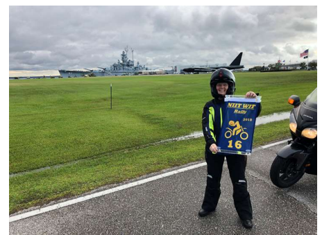
USS Alabama in Mobile