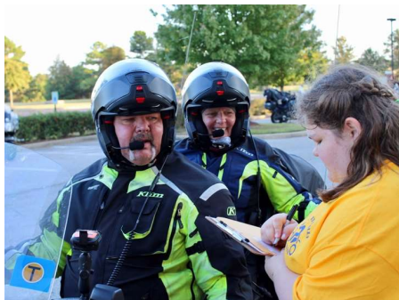
Checking in at 5:40 pm

We jump back on the bike and check-in to Rally Headquarters with 20 minutes to spare! We rode our route as planned! Let's see how we score!