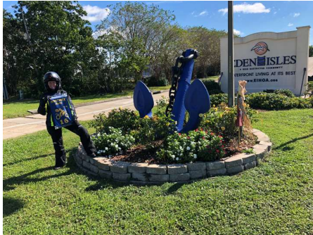
Anchor in Slidell, LA

be a great day to ride and we're having a blast! Next component for our fleet is an anchor in Slidell, LA.