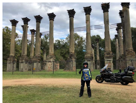
Windsor Ruins in MS

We bag the Memphis Orpheum Theater early this morning instead of later in the day on our way back. Perfect timing! In and out of in minutes! On to Chester!