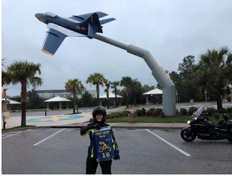
Blue Angels jet in Pensacola